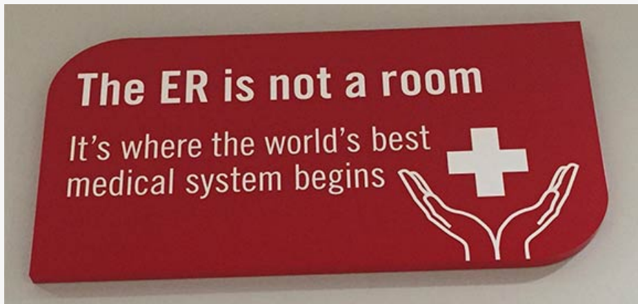
Picture taken at ACEP Headquarters